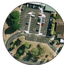
St Dymphna's Primary School Apley (2006)