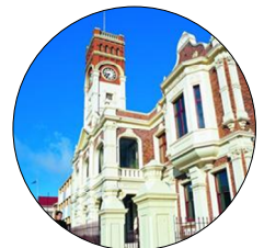
Toowoomba CBD Parking Strategy Toowoomba City Council (2002)