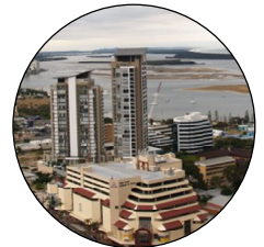
Southport Parking Study Gold Coast City Council (1999)