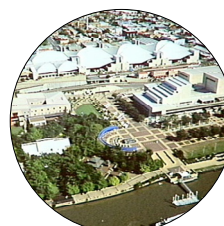
South Brisbane West End Parking Study Brisbane City Council (2007)