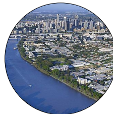
Riverside Drive Closure Parking Impacts Brisbane City Council (2006)