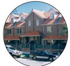
Residential Parking Review Dept of Housing (2005)