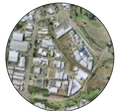
Hinkler Court Santalucia Group (2002)