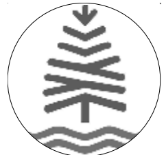
Pine Rivers Transport Study Pine Rivers Shire Council (2000)