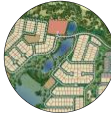
Warner Lakes Peet Ltd (2001)