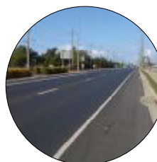
354-364 South Pine Road CSR Ltd (2007)