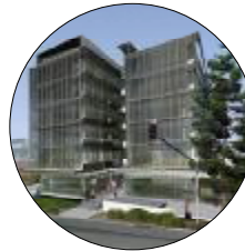
Strathpine Central Chesney Developments (2008)