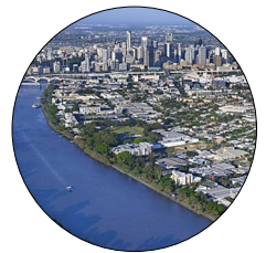
South Brisbane Riverside Renewal Strategy, EMME, Brisbane City Council (2009)