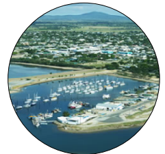
Bowen Marina, Bowen, SIDRA, Jag Marine Group Pty Ltd (2006)