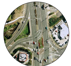
Aspley Park Central, TRANSYT, Wadley Constructions Pty (2009)