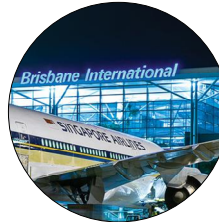
Brisbane Airport Strategic Plan, EMME, Brisbane Airport Corporation (2008)