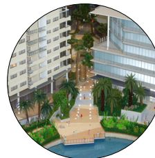
Emporio, Maroochydore, SIDRA, Reed Property Group (2009)